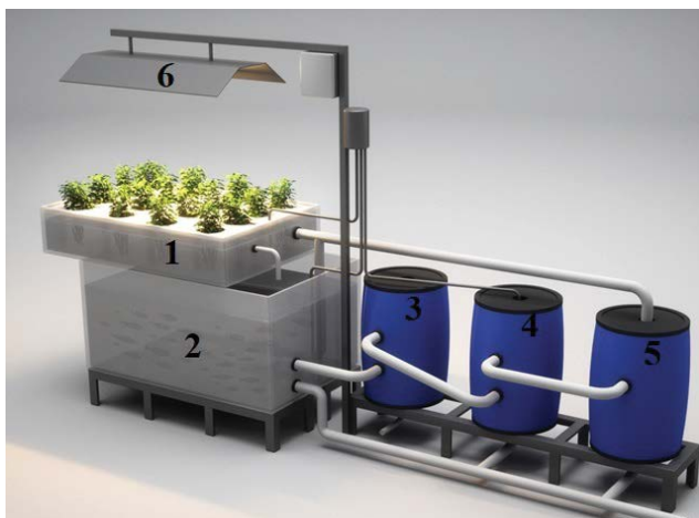
Figure 1: 3D Visualization of the aquaponic system. 1: Plants hydroponic tank (raft system) 2: Fish tank 3: Mechanical filter 4: Biological filter 5: Sump 6: Lamp.

No fish mortality occurred. Weight gain was statistically significant higher in the first aquaponics system (system I) (WG) ( 95.8 \pm 13.62 g) in comparison to the second system II, where it was 51.7 \pm 9.90 g. Specific growth rate was higher in system I (SGR%/day, 1.8 \pm 0.17 ) in comparison to system II 1.2 \pm 0.16\% /day but no statistically significant. The results are related with